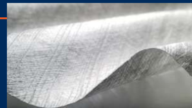
TenCate Polyfelt® TS

TenCate Polyfelt® TS geotextiles are mechanically bonded continuous filament nonwovens made from 100 % UV stabilized polypropylene. They have been used for decades as separation and filtration elements in a large number of civil engineering applications.